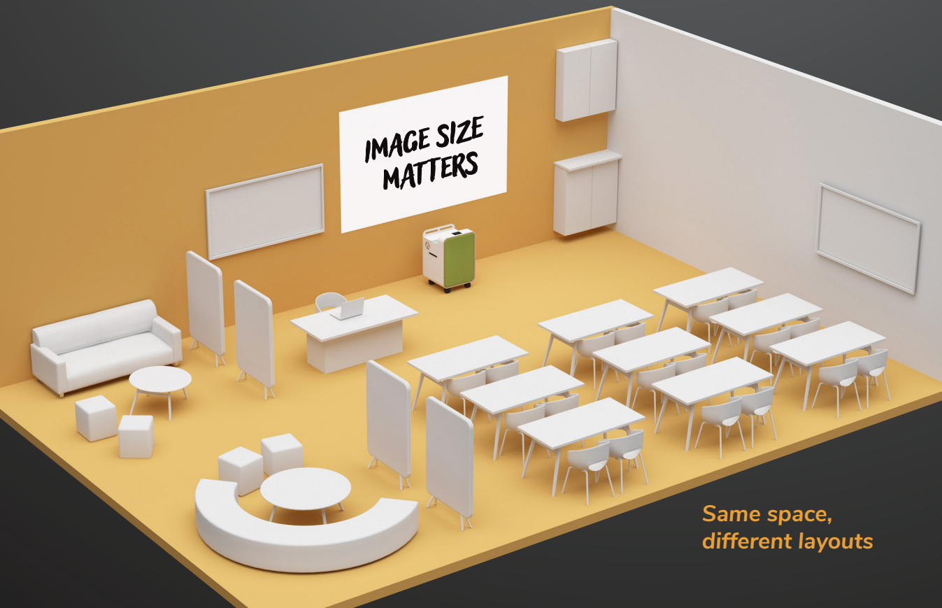
Same space, different layouts

Artome S1 makes it easier for you to create multiple classroom layouts effortlessly with a movable, installation-free AV solution. Transform any room into various educational environment, enhancing possibilities in your teaching approach and providing students with dynamic and engaging learning experiences. Whether you want to facilitate group collaboration, simultaneously teach individualized classes, or convert the classroom into a presentation space for a parent-teacher meeting, Artome S1 ensures your space is always ready to adapt to your needs, enabling the transformation of the classroom layout to support versatile pedagogical practices and classroom dynamics.