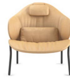
Funda Bold 4 metal legs