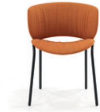
Funda chair 4 metal legs