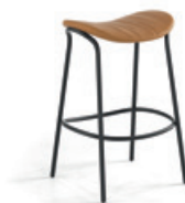
Funda counter stool metal legs