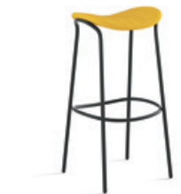
Funda bar stool metal legs