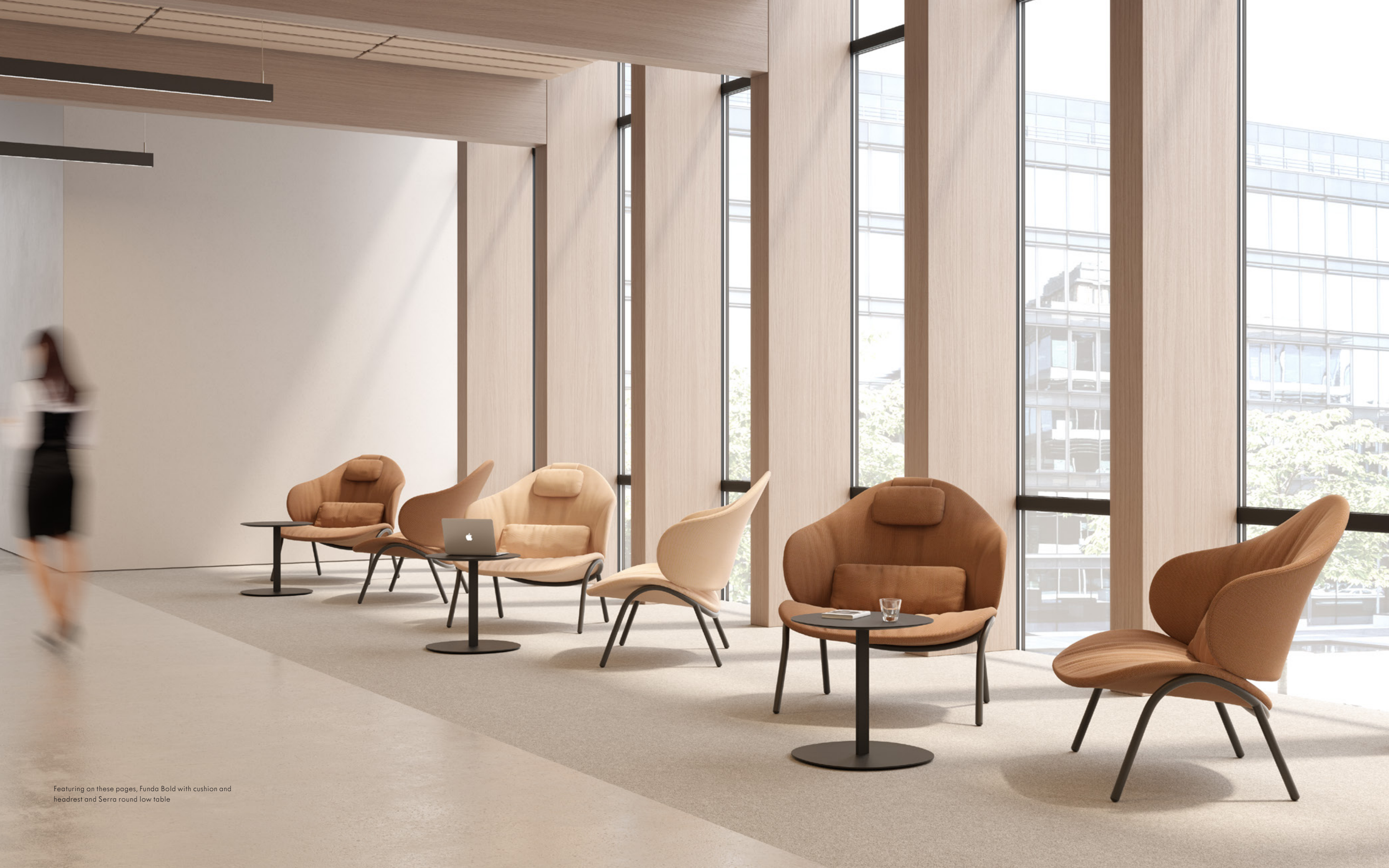
Featuring on these pages, Funda Bold with cushion and headrest and Serra round low table