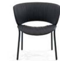
Funda armchair 4 metal legs