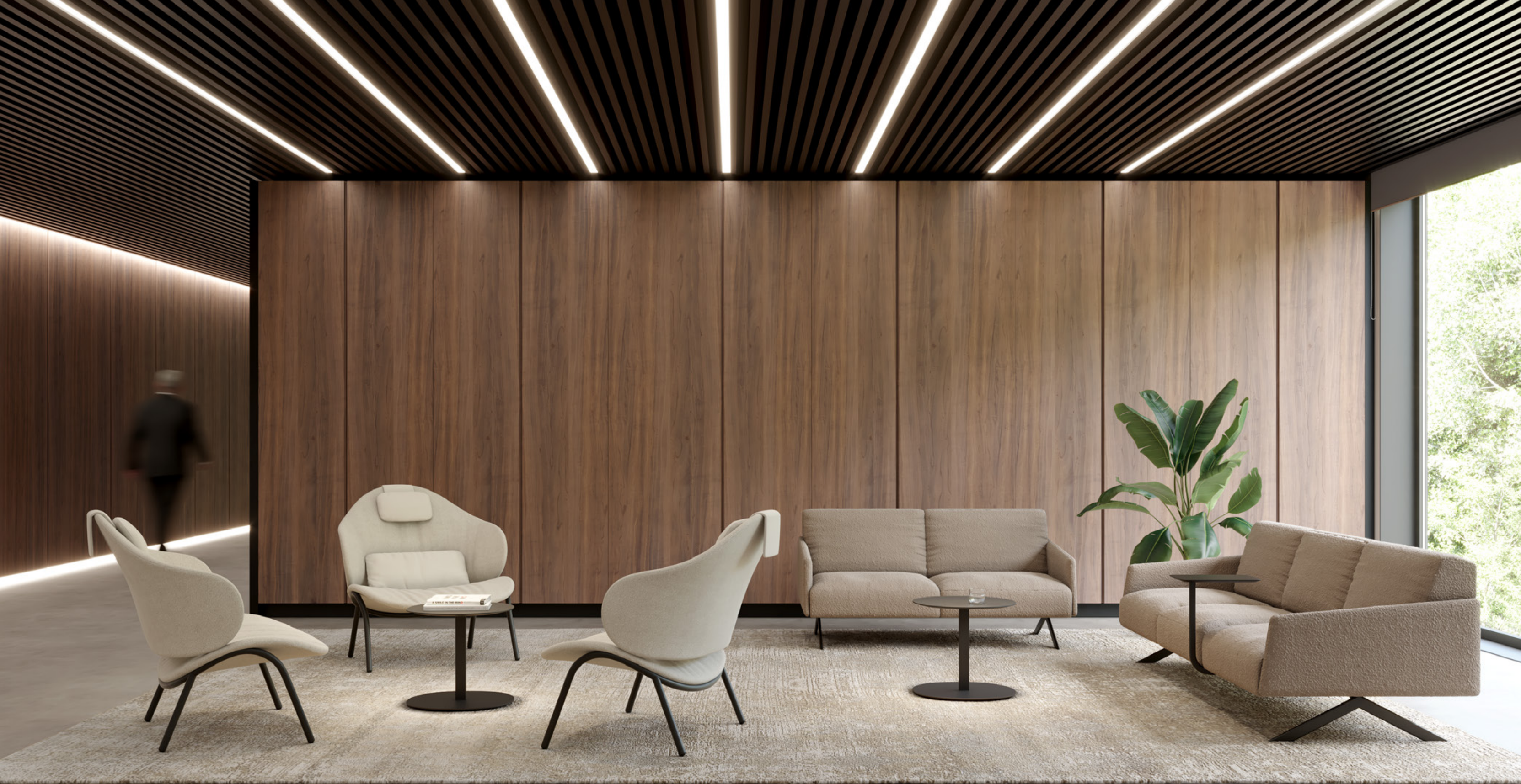
On the left page, Funda Bold in different finishes with cushion and ottoman. On this page, Two Funda Bold with cushion and headrest.