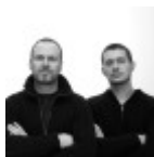
Tveit & Tornøe