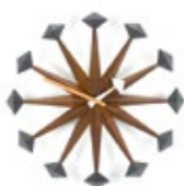
Polygon Clock, walnut, Ø 16 7/8"