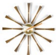
Spindle Clock, walnut/aluminium, Ø 22 3/4"