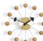
Ball Clock, cherry, Ø 13"