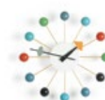
Ball Clock, multicolored, Ø 13"