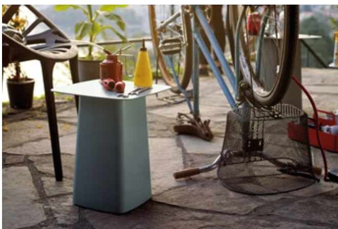
Metal Side Table (Outdoor)

The galvanised Metal Side Tables, optionally powder-coated with a fine surface texture, are weatherproof occasional tables and come in several sizes.