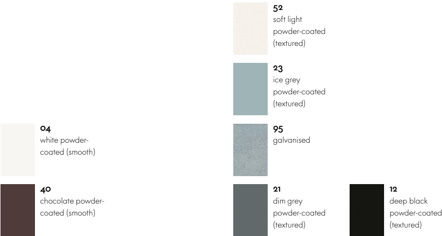
Table top and base