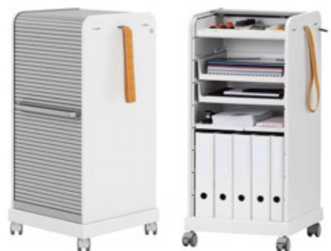
Follow Me 2