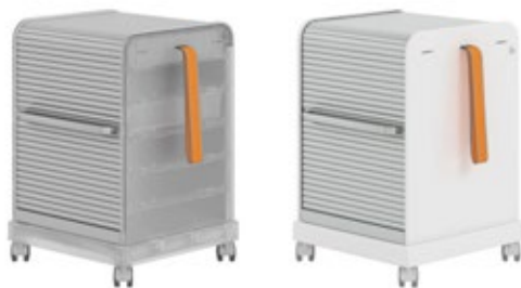
Follow Me 1

shutter. Both models can be individually configured with optional drawers and shelves. The higher Follow Me 2 version makes an ideal companion for standing-height tables.