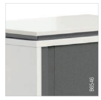
Desktop/ Carcass: Snow WY Slot: Slate 490 Front: Pearl Slate ZX