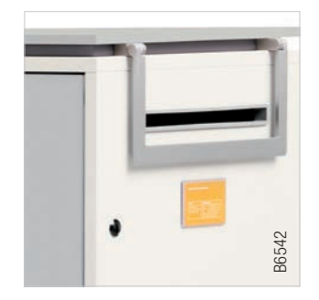
Desktop/ Front: Metallic Aluminium 320 Slot: Slate 490 Carcass: Snow WY