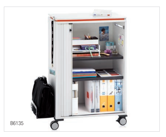
Keeps key papers organised and has shelf space for A4 binders, samples and brochures, plus grab-and-go bag deposit outside.