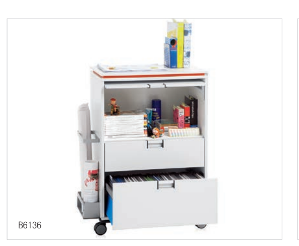
Pull-out filing frames and a secure draw for reference materials, a holder to house proofs, drawings and plans, and book-ends to secure reference books.