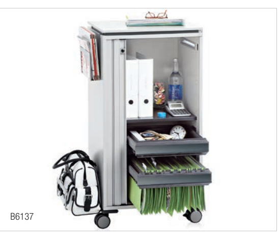
Hanging files for documents and vertical space for A4 binders, a tidy drawer, a lockable sliding door and external features.