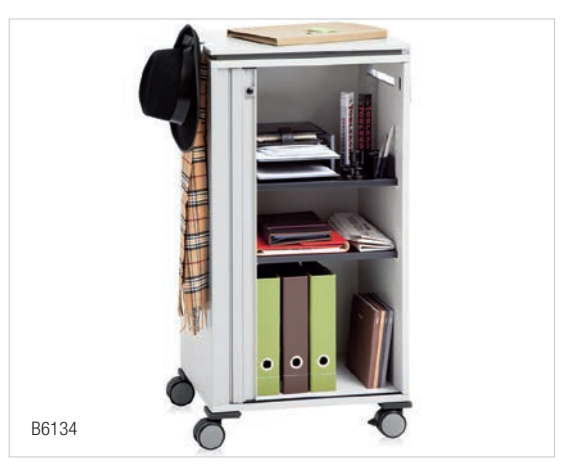
Less is more: a slim, simple configuration with a lockable sliding door for confidential documents and a hook for outdoor clothes.