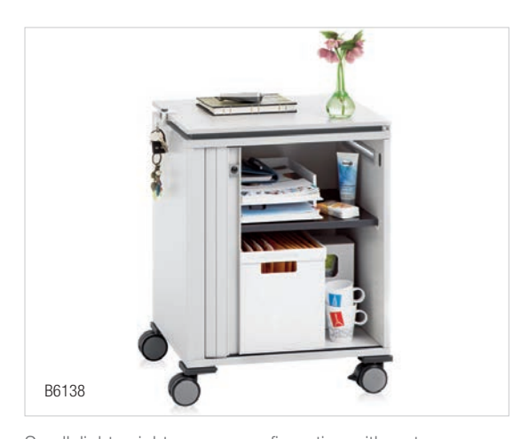
Small, lightweight, secure configuration with a storage box and shelf space for a few essential items.