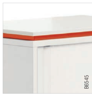
Desktop/ Front: Snow WY Slot: Red Orange 590 Carcass: Snow WY