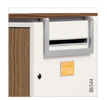
Desktop/ Front: American Walnut NU Slot: Slate 490 Carcass: Snow WY