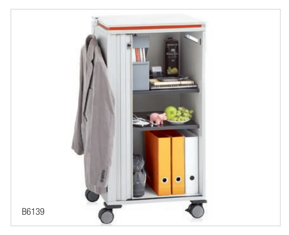
Secure sliding doors keep personnel files from prying eyes; space for a diverse range of files and personal effects.