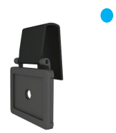
Divisio Name Tag 41 € (minimum quantity 2) Price per unit