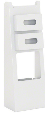
Model code Recycling Dispenser: X5SP2105239

Steelcase standard metal paints can be requested. Conditions apply.