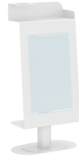
Model code Display Dispenser: X5SP2105240