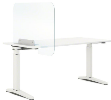
Model code lateral polycarbonate: XFRSLAT1000

Pop-Up Shields are polycarbonate on-desk freestanding separations. Lateral screens can be easily installed onto desks, benches and meeting room tables. The Frontal version can be placed anywhere on the desk top and easily moved.