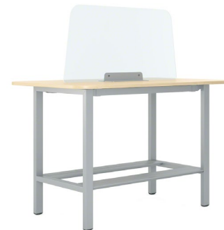
Model codes frontal polycarbonate: XFRSF1200 XFRSF1400