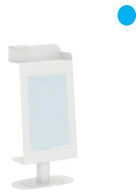
Display Dispenser W350 mm H850 mm 200 € Price per unit