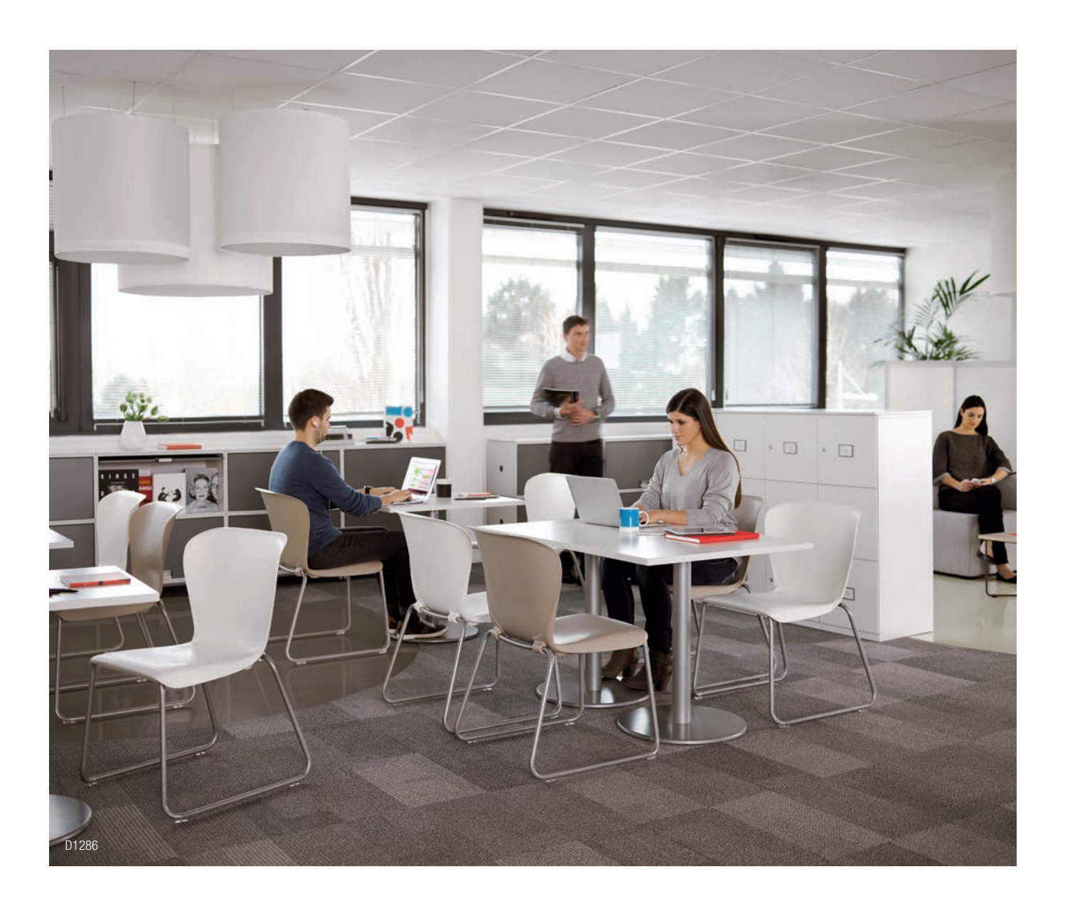
WESTSIDE CAN BE STACKED 8 HIGH INDEPENDENTLY and when using a dolly, or up to 15 for a trolley.